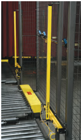
Light curtain photoeyes with full "muting" protect the wrap area.

Category 1 or 3 standards are available optionally.