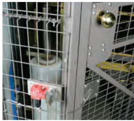
Two electrically interlocked doors on the film side allow for convenient yet secure entry to the wrapping zone.